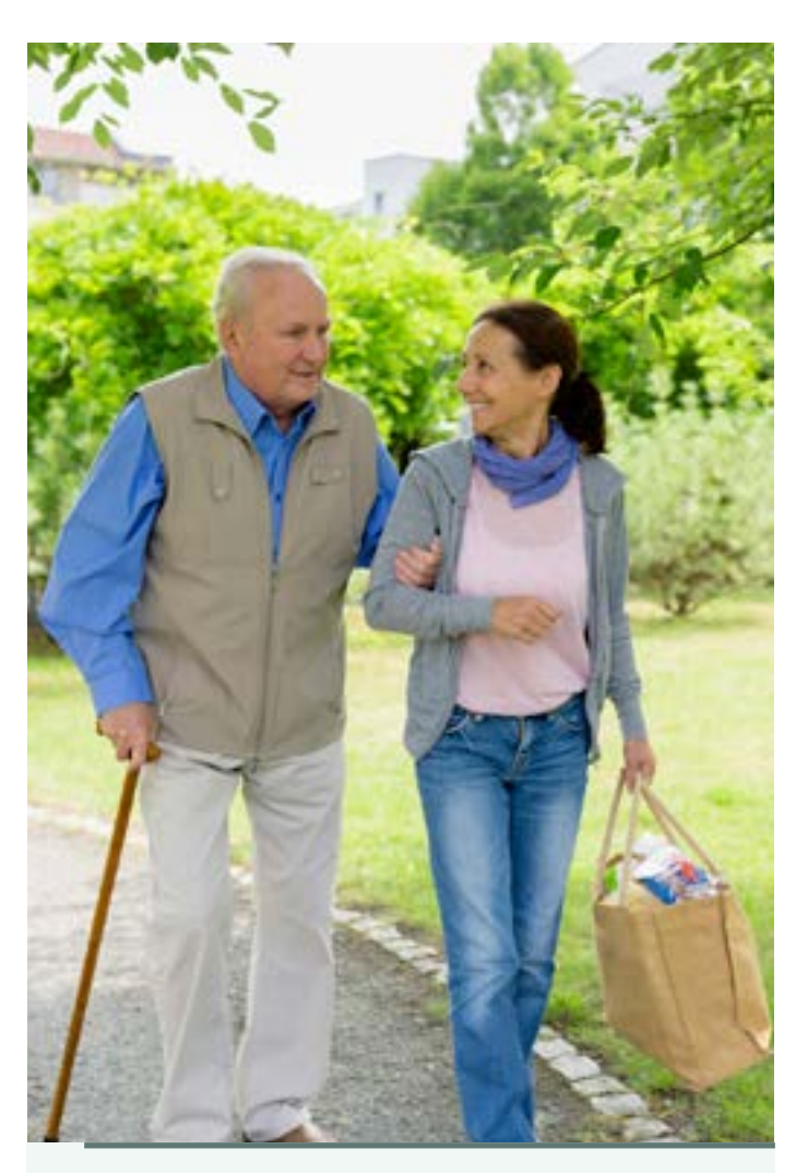
Caregivers are strong and courageous individuals who play an important and invaluable role in society.