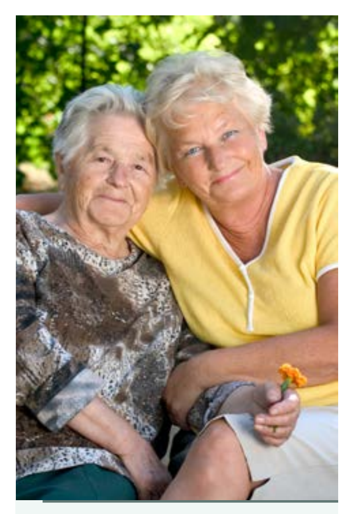
An honest conversation can help relieve tension, resolve problems and erase negative feelings.