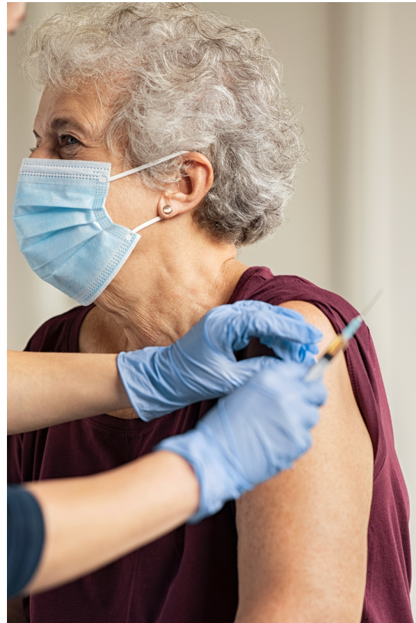
Dec. 14, 2020: The first shipment of the vaccine arrives in New Brunswick with 1,950 doses.

More information on New Brunswick's vaccine strategy, the immunizations and the rollout can be found here . If you want to know how many vaccines have been given, visit the GNB COVID-19 Dashboard .